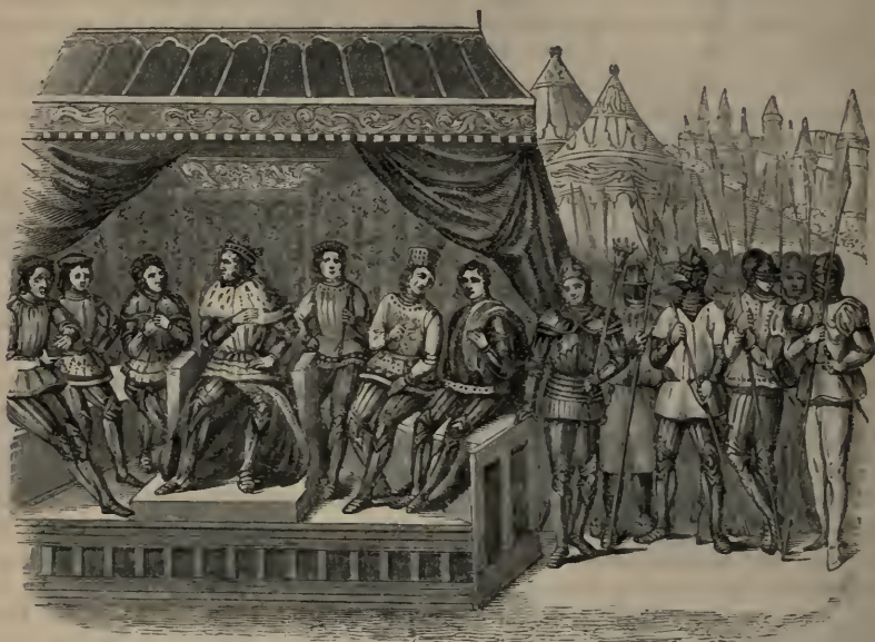
KING OF HUNGARY HOLDING A COUNCIL WITH THE FRENCH KNIGHTS. From MSS. of the 15th Century.

With the king of Hungary rode the greatest barons of his realm, as was proper, and by his side John of Burgundy, who often conversed with him. They were full sixty thousand horse: the infantry were few in number, indeed none but the followers of the army. The array of the Christians was noble and handsome; and among the Hungarians were many cross-bow men on horseback. This army advanced until it came to the banks of the Danube, which it crossed in barges, boats, and pontoons, prepared some time since for this purpose. It was more than eight days before all had passed over; and as they landed on the opposite shore, they lodged themselves to wait for their companions. The Danube divides the kingdoms of Hungary and Turkey. When the whole army had crossed, they were delighted to find themselves on Turkish ground, for they were impatient to try the courage of the Turks. After a council, they resolved to besiege a town in Turkey called Comecte*, and made preparations to invest it on all sides. This could easily be done; for